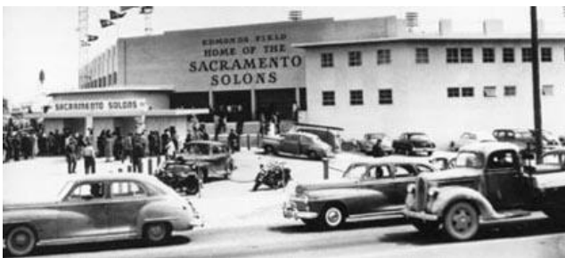
Solon (Edmonds) Park 1949

On January 4, 1961, the Solons were sold and moved to Hawaii, and Edmonds Field was demolished in May of 1964.”